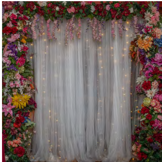
My inspiration for the Challenge my Wedding Altar I made with lots of flowers

Penwag Challenge First Quarter Due at the April Meeting April 8, 2023